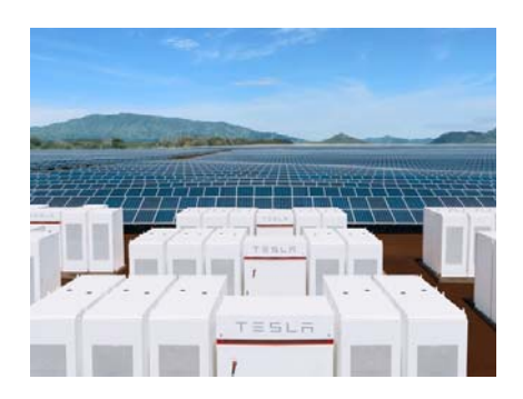
Hurricanes Clear The Way For Tesla To Power Puerto Rico & The Caribbean